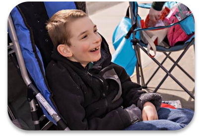
Children with disabilities