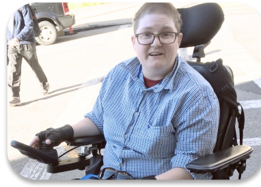
Adults with disabilities