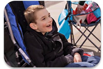
Children with disabilities